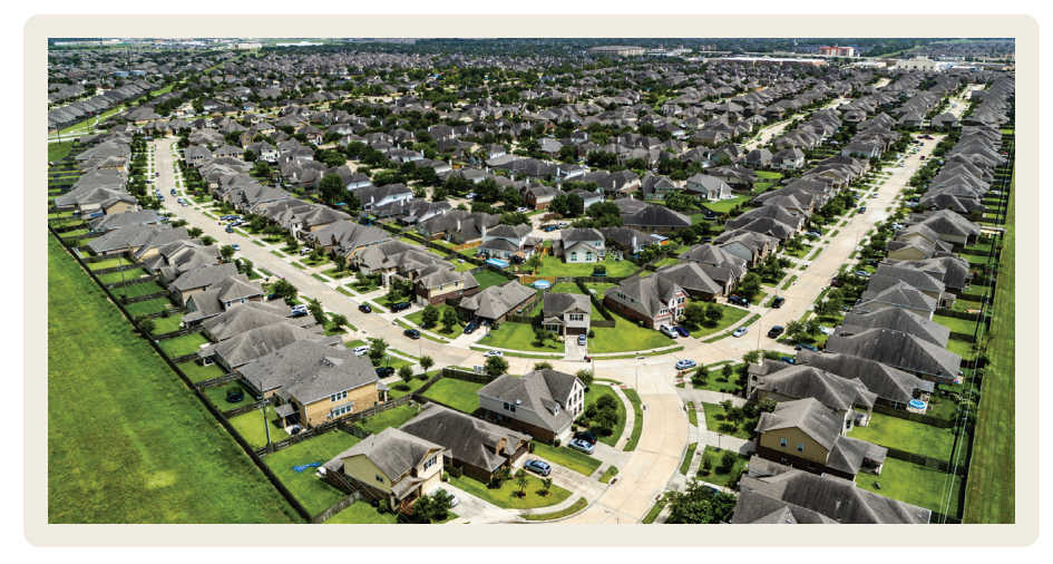
Fieldstone (Houston, TX): All 1,100 lots developed and sold as of December 2019.

Though these three months have been surprisingly strong, we remain careful not to predict what this performance portends for the next quarter, particularly in this time of COVID-19. As recent weeks have reminded us, life is always uncertain, especially in the near term.