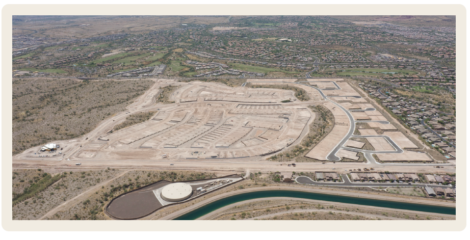
Lake Pleasant (Phoenix, AZ): First contracted phase of over 400 lots nears completion.