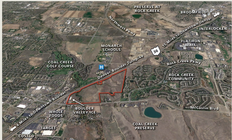
Superior Town Center, Superior, CO

Early this month, Avanti announced a partnership with Ranch Capital in the acquisition of the land planned for The Superior Town Center, in Superior, CO, in one of the most vibrant – yet supply-constrained – corridors in the metropolitan area. The 159-acre site is strategically located at the Denver-Boulder Turnpike's first interchange when traveling from Denver into Boulder County.